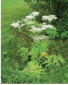
Diana Shermet, CLOCA