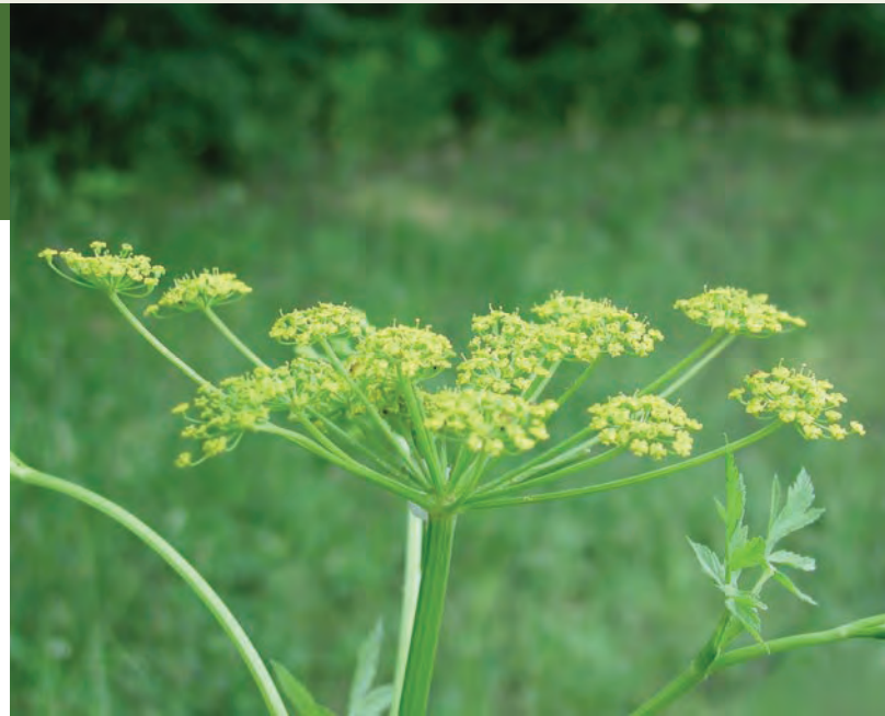
Flowers grow in yellowish-green clusters

In North America, scattered wild parsnip populations are found from British Columbia to California, and from Ontario to Florida. It has been reported in all provinces and territories of Canada except Nunavut. The plant is currently found throughout eastern and southern Ontario, and researchers believe it is spreading from east to west across the province.