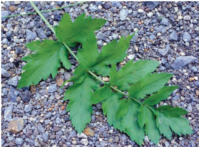
Compound leaves are arranged in pairs