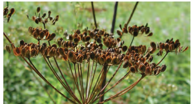
Yellowish-green flowers turn into round, flat brown seeds